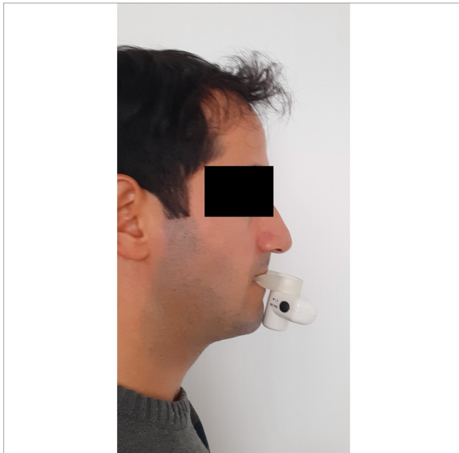
Figure 1. Application of the mechanical vibration

repeated 24 and 48 hours later, and the gum was chewed for a total of 60 minutes. All chewing gum sessions were conducted at the clinic and under the same supervisor. Lastly, the third group served as the control. No procedure was implemented on these participants aside from routine orthodontic treatment.